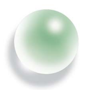
Conventional spray oil droplet