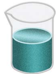
TRITEK Stays mixed for up to 3 hours