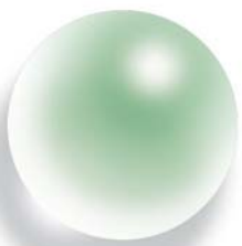
Conventional spray oil droplet

These smaller oil droplets assure that only a very thin, even coating of oil will be applied to the plant. Thin and even coverage enables TRITEK to be more effective in killing insects as well as being safer for the plant. Remember, the oil droplet is reduced to approximately 1/14th its original size, but without proper emulsification, these oil droplets would coalesce back into larger droplets like conventional products, and be at higher risk for emulsification breaks and phytotoxic results.