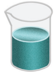
TRITEK Stays mixed for up to 3 hours