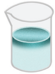
Conventional spray oil mixture Separates and rises to top in minutes

Manufactured using the finest "narrow range" oils and emulsifiers, TRITEK doesn't put your crop at risk by using heavy oils known for their phytotoxic risk. The unique formulation of TRITEK provides excellent coverage and durability with little risk of phytotoxicity.