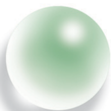
Conventional spray oil droplet

These smaller oil droplets assure that only a very thin, even coating of oil will be applied to the plant. Thin and even coverage enables TRITEK to be more effective in killing insects as well as being safer for the plant. Remember, the oil droplet is reduced to approximately 1/14th its original size, but without proper emulsification, these oil droplets would coalesce back into larger droplets like conventional products, and be at higher risk for emulsification breaks and phytotoxic results.